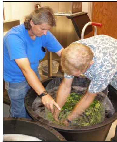
Figure 6. Cylindrical mesh basket in wash drum.