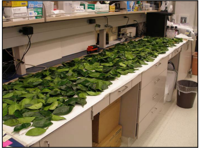
Figure 10. Leaves spread out to dry.