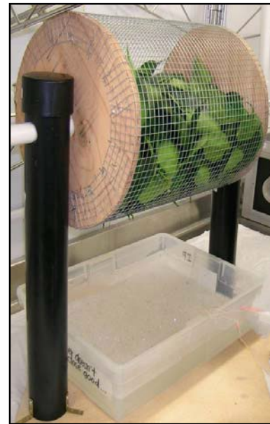
Figure 2. Raffle drum-type tumbler with catch pan.