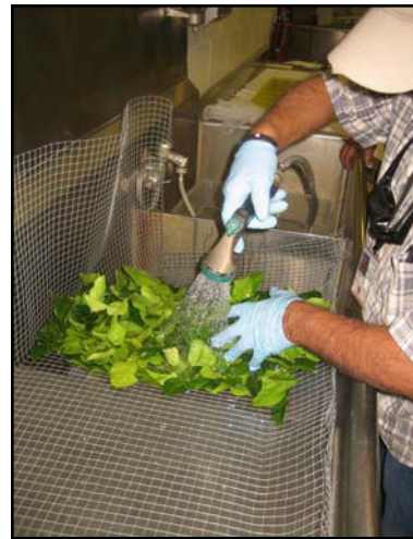
Figure 4. Rinse hose and mesh to support leaves.