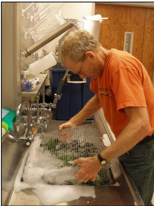
Figure 7. Mesh wash basket.