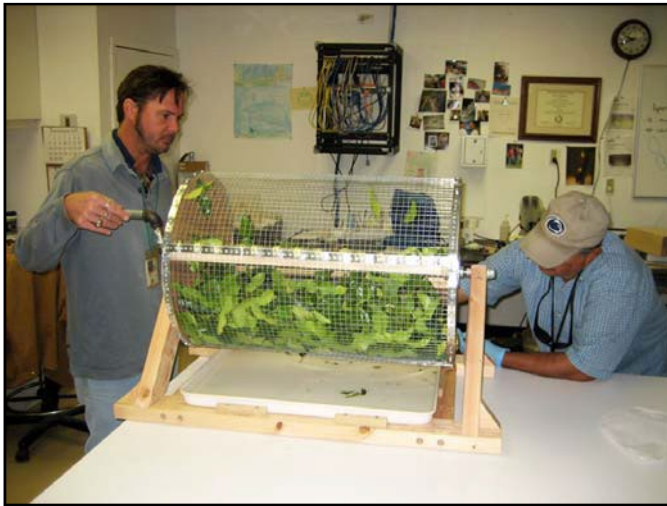
Figure 1. Raffle drum-type tumbler with catch tray.