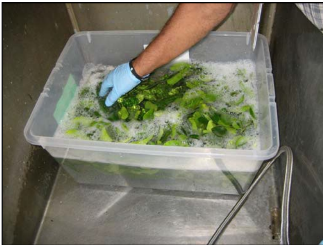
Figure 3. Leaf wash basin.