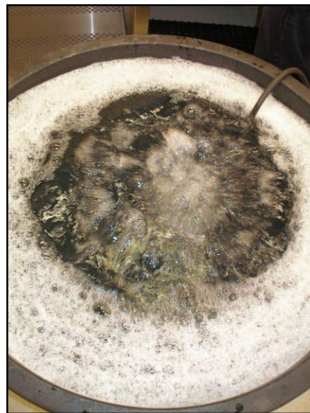
Figure 8. Wash tub with air hose to produce foaming action.