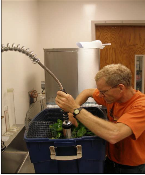
Figure 9. Rinse hose with potable water.